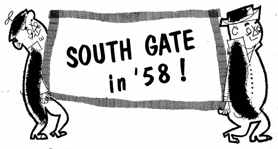
The JOURNAL of the World Science Fiction Society, Inc. 204 Wellmeadow Road, Catford, London S.E.6, England

Address is 1721 Grand Avenue, Bronx 53, New York, U.S.A.